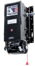
Jackshaft Sectional Doors