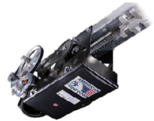
Trolley Sectional Doors w/ Trolley