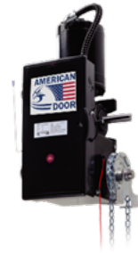
Hoist Roll Up Doors

Fire-safety option with thermo-couple and drop test system; NEMA 4/12 Watertight/Oil-Tight; NEMA 4X Corrosion Resistant; Expansion boards; In-ground vehicle detection loops; Safety and control peripherals including, but not limited to safety systems, alerting systems, and master-slave tie-in to other motorized systems; Non-ventilated or fan cooled; Emergency Egress; 50 Hz power for international use; Timer Close Module; Battery backup; Heat Detector; Smoke Detector; External Interlock Switch; Hand Crank; Card Reader; Key-less Entry; Motion Detector; Treadle Switch; Pull Switch; Key Switch; Emergency Stop Button; 3 Button Control with Key Lockout; NEMA 7/9 Rated Control Box