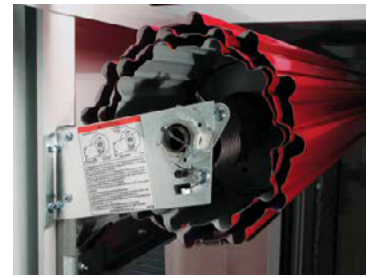
Easy Adjustable Spring

Insulation; Wind Load Enhancement; Choice of 200 Colors Powder Coating; Weather Seals; Counter Shutter Configuration; Chain Hoist; Electric Motor