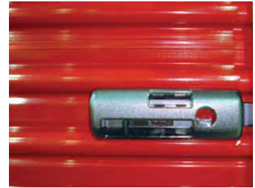
Optional Curtain Lock