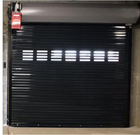
Motor: L Plate mounted motor Slat: Standard double-insulated flat slats plus vision slats.