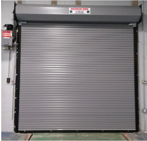
Motor: Wall mounted motor Slat: standard double-insulated flat slats.