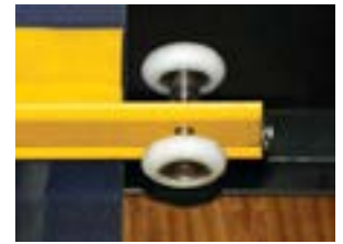
Articulating roller wind strut