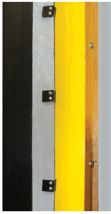
Continuous curtain locks on both edges